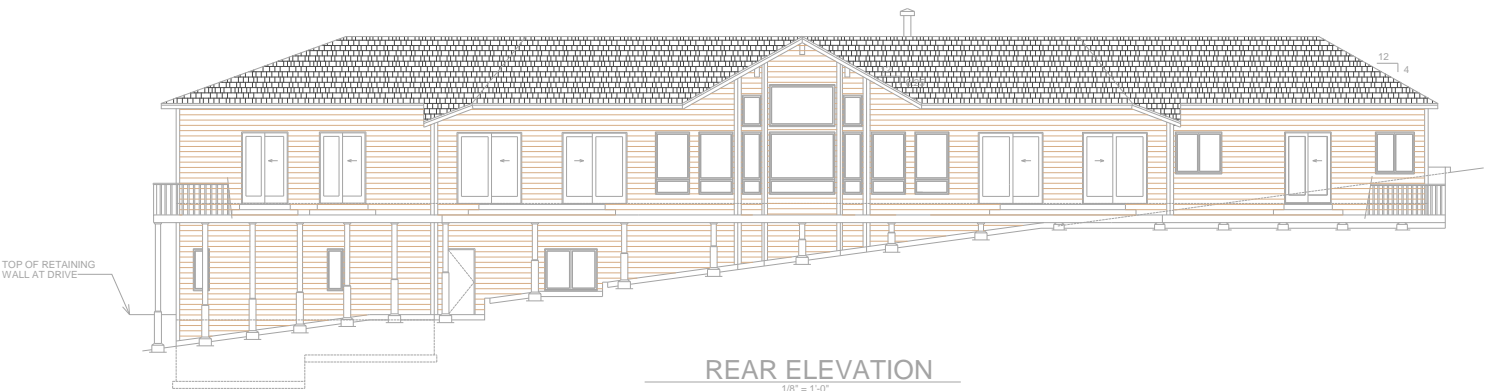
REAR ELEVATION 1/8" = 1'-0"