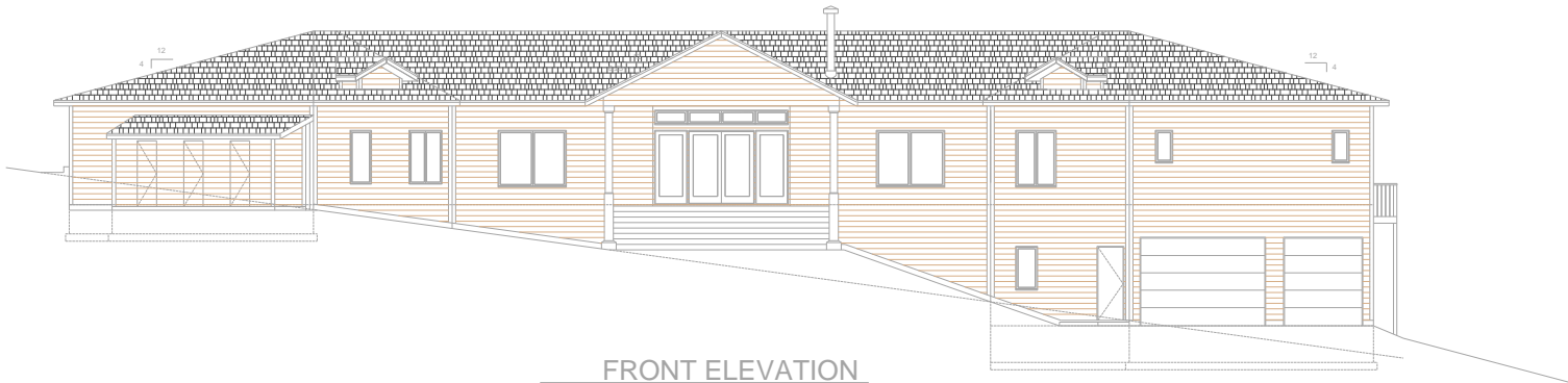
FRONT ELEVATION 1/8" = 1'-0"